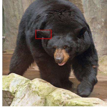
English: A bears right black ear. Object Tags: bear Hindi: एक भालू सही काले कान। Bengali: একটি ভালুক কানের কান ভালুক। Malayalam: ഒരു കരടിയുടെ വലത് കറുത്ത ചെവി